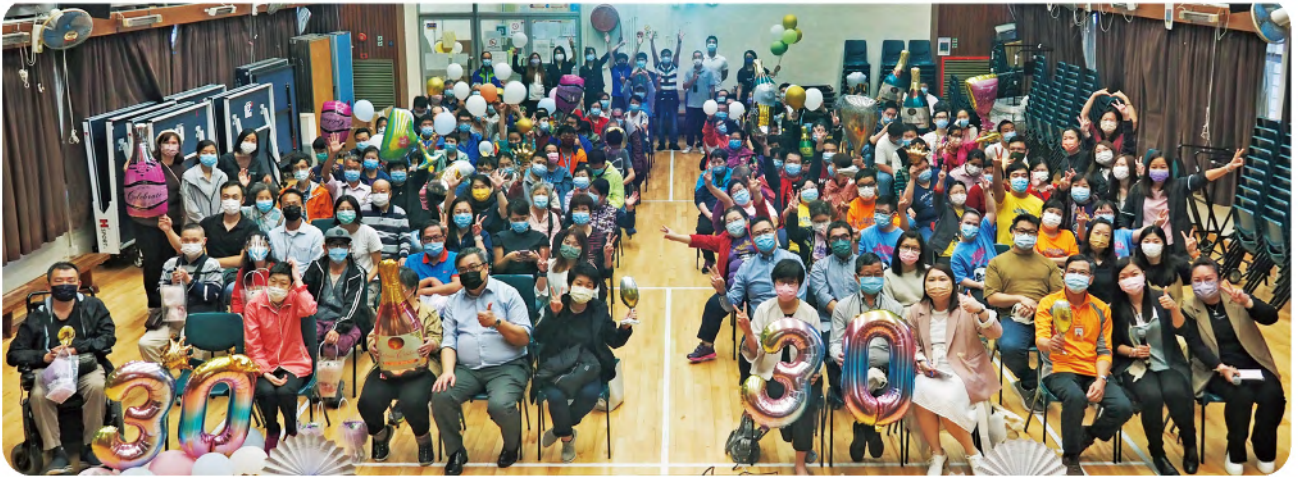
▲ 翠林綜合職業復康服務慶祝成立30周年。 Tsui Lam IVRS celebrated its 30 th anniversary.