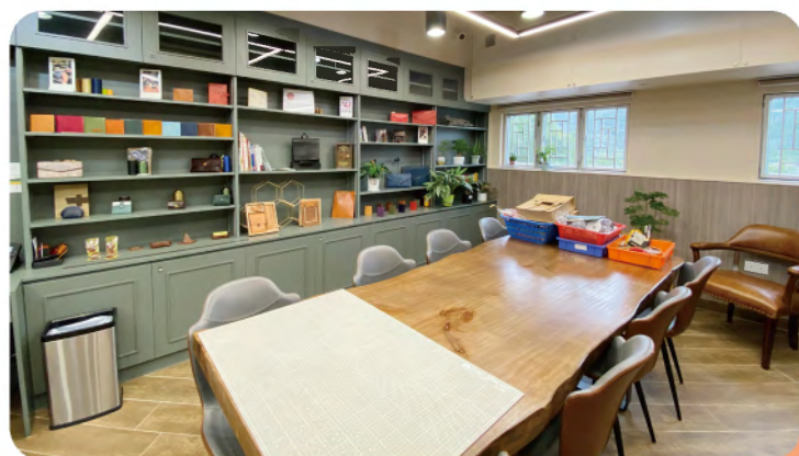
▲ 成立全港第一間皮革製造訓練中心。 We set up the first Leather Manufacturing Training Centre for People with Disabilities in Hong Kong.