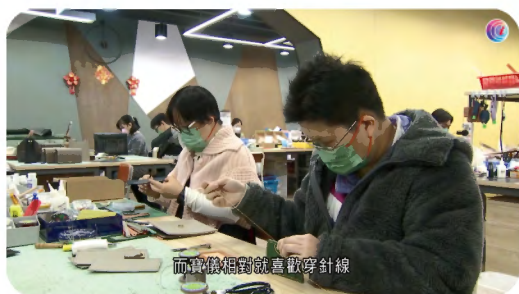
▲ 學員於訓練中心內接受傳媒採訪。 Our service users were interviewed by the media in the training centre.

我們與商業伙伴合作，推出 Andcare 品牌單車專用袋，嘗試把學員生產的皮革製品，推廣到零售市場。並於2021年12月接受香港開電視節目《小事大意義》訪問，將學員的才能向社會大眾展現。